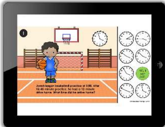
Google Slides activity (20 slides) or Seesaw activity (19 slides)

When you purchase, you have the option of using the Google Slides self-checking activity, the Seesaw self-checking activity, Google Forms task cards (in a quiz format), or the printable task cards. The file includes specific instructions for using the digital versions. The same questions are in all four versions.