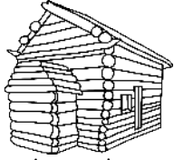
Lincoln was born in a log cabin in Kentucky.

Abraham Lincoln was born in a one-room log cabin in 1809. His family lived in the Kentucky wilderness . The cabin had a single window and a dirt floor.