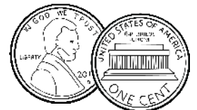
Lincoln is on the front of the penny. The Lincoln Memorial is on the back.

During the war, Lincoln signed the Emancipation Proclamation . This important document set millions of slaves free. Sadly, a few days after the war ended, Lincoln was shot and killed.